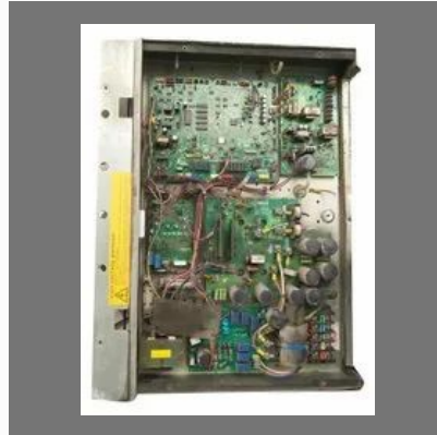
Mitsubishi VRF PCB Board