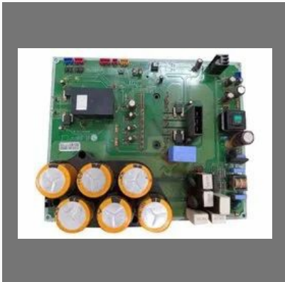
LG VRF Inverter PCB Board