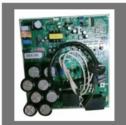
Samsung VRF Inverter PCB Board