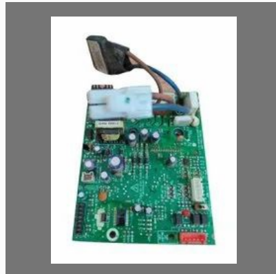
Midea VRF Fan PCB Board