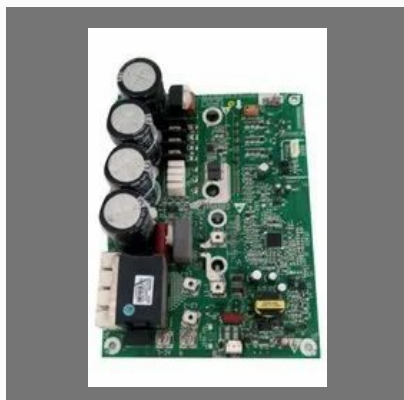
Blue Star VRF Inverter PCB Board