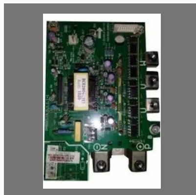
Midea vrf pcb card