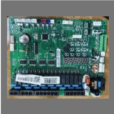
Blue Star VRF PCB Board